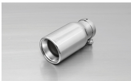
#05: tail pipe Ø 90 mm, chromed