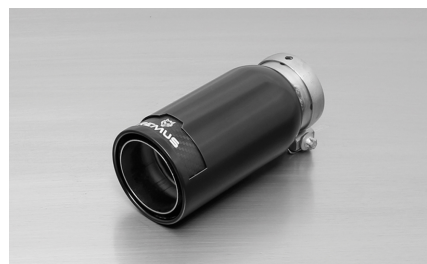
#83CB: tail pipe Ø 84 mm Street Race Black Chrome