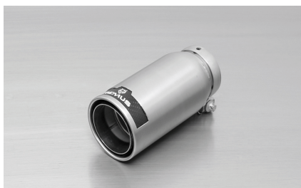
#83C: tail pipe Ø 84 mm Street Race, polished