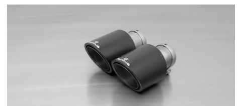
#83CTS: Carbon-tail pipes Ø 84 mm angled, Titanium internals