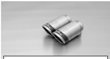
#83CS: tail pipes Ø 84 mm Carbon Race, polished