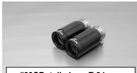
#83CB: tail pipes Ø 84 mm Street Race Black Chrome