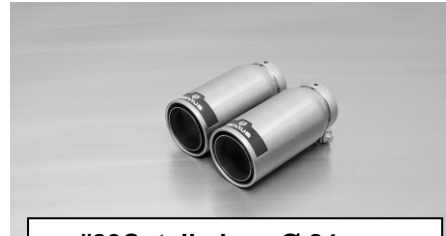
#83C: tail pipes Ø 84 mm Street Race, polished