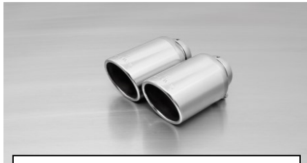
#55S: tail pipes Ø 84 mm angled, chromed