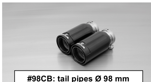
#98CB: tail pipes Ø 98 mm Street Race Black Chrome