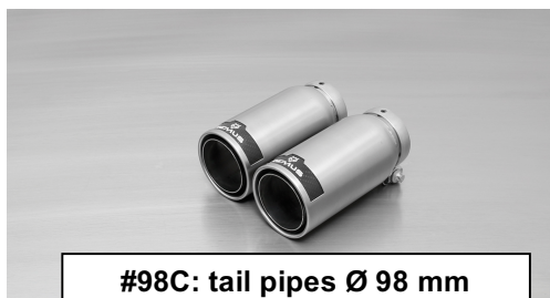
#98C: tail pipes Ø 98 mm Street Race, polished