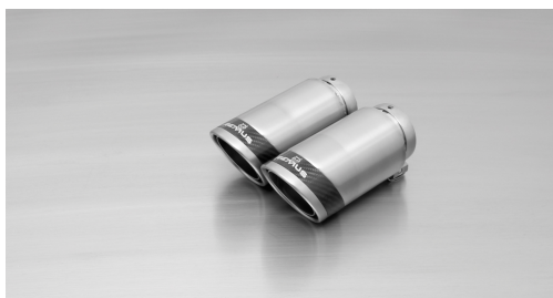
#83CS: tail pipes Ø 84 mm Carbon Race, polished