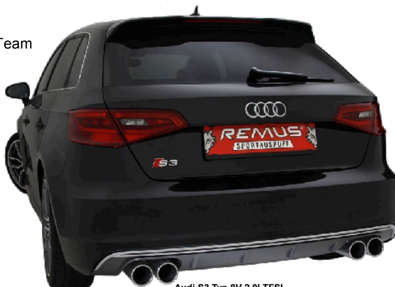
Audi S3 Typ 8V 2,0l TFSI