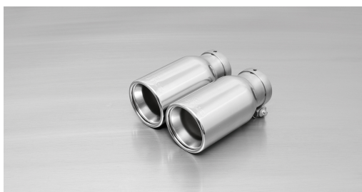
#05: tail pipes Ø 90 mm, chromed