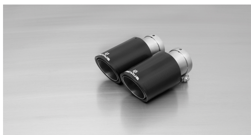
#83CTS: 2 Carbon-tail pipes Ø 84 mm angled, Titanium internals