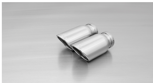
#55S: tail pipes Ø 84 mm angled, chromed