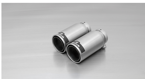
#83C: tail pipes Ø 84 mm Street Race, polishes