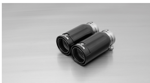
#83CB: tail pipes Ø 84 mm Street Race Black Chrome